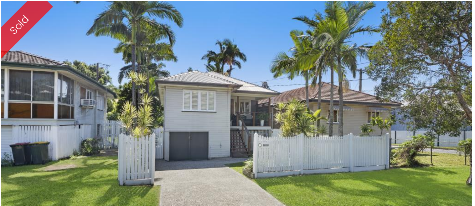
34 Arnott Street, Kedron