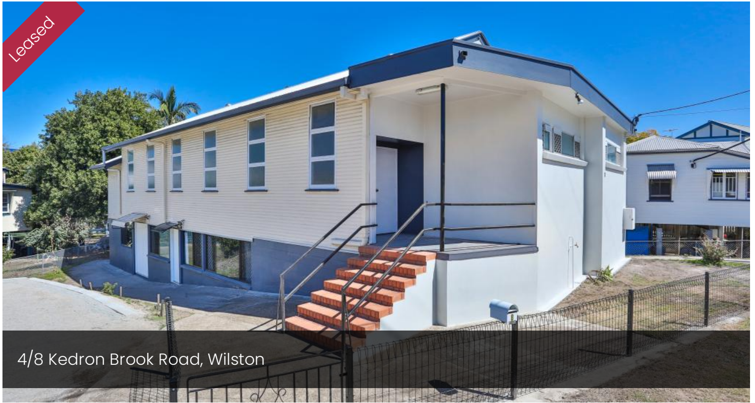
4/8 Kedron Brook Road, Wilston